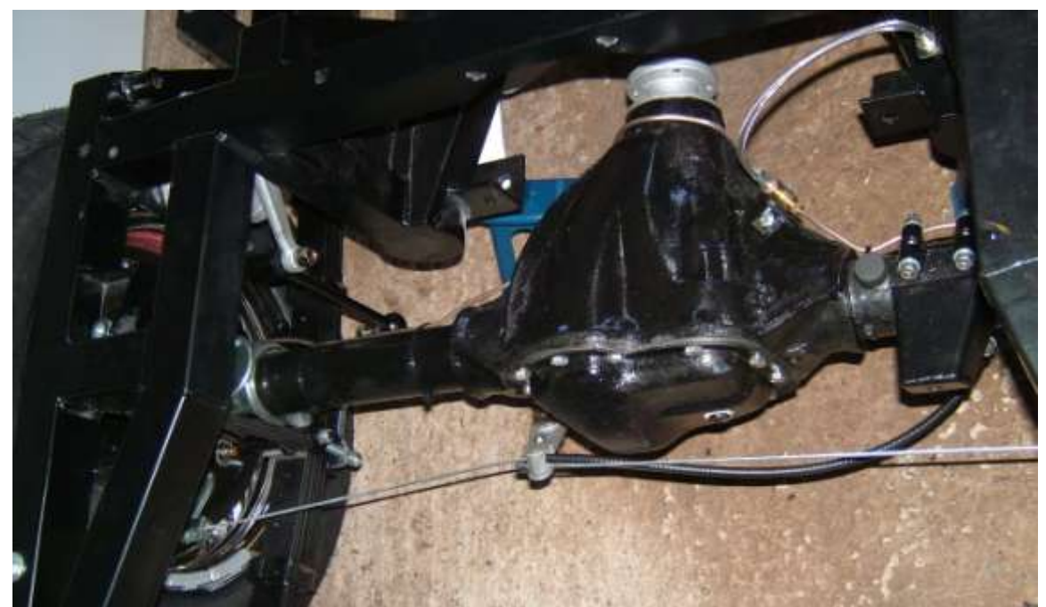
After a long wait the modified spring brackets arrived from the Gerry's fabricators. These brackets mount below the springs and connect to the shock absorber drop arms. The modification is to have two plates welded to them to accept the trailing arms (anti tramp bars). Unlike on the MGB, these are mounted upside down.